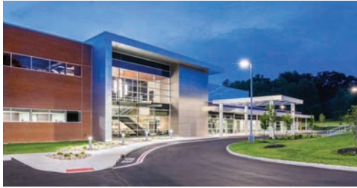
Howland Medical Center

Proud Supporter of Opera Western Reserve