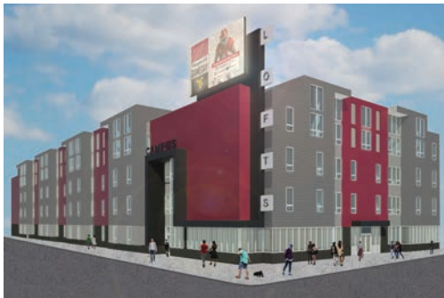
Campus Lofts - YSU

201 West Federal Street * Youngstown, Ohio 44503 * 330.743.1177 www.strolloarchitects.com