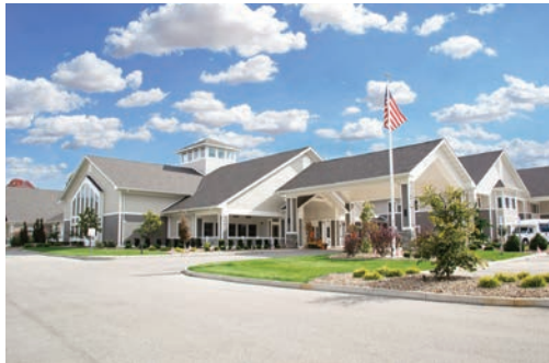
Inn at Poland Way